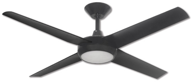
CL507 MATT BLACK With matt black blades 1320mm (52")