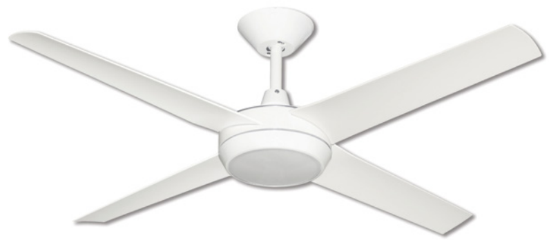
CL506 WHITE With white blades 1320mm (52")