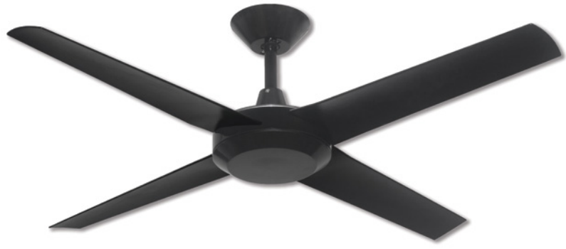
C501 MATT BLACK With matt black blades 1320mm (52")