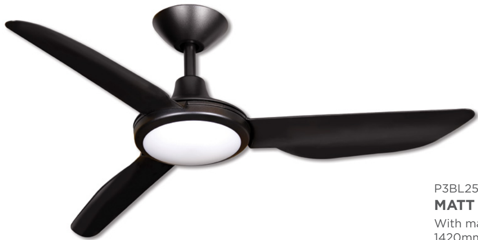
P3BL2586 MATT BLACK With matt black polymer blades 1420mm (56")