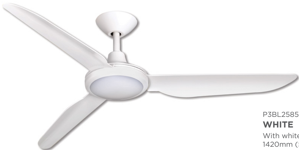
P3BL2585 WHITE With white polymer blades 1420mm (56")