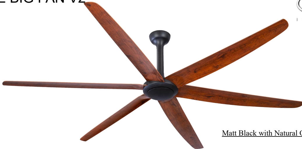
Matt Black with Natural Oak Blade