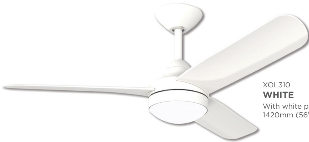
XOL310 WHITE With white polymer blades 1420mm (56")