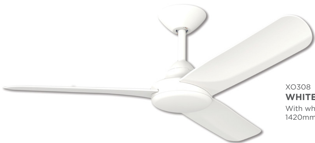
XO308 WHITE With white polymer blades 1420mm (56")