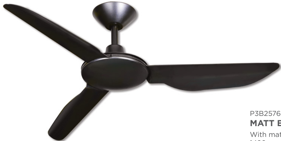
P3B2576 MATT BLACK With matt black polymer blades 1420mm (56")