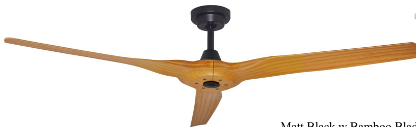
Matt Black w Bamboo Blades