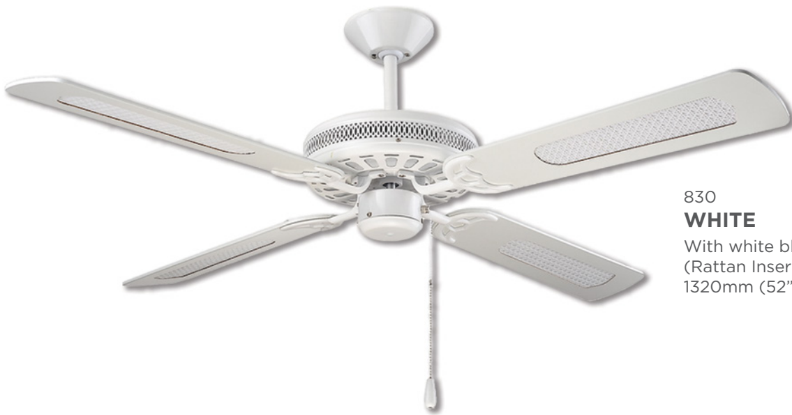
830 WHITE With white blades (Rattan Insert on one side) 1320mm (52")