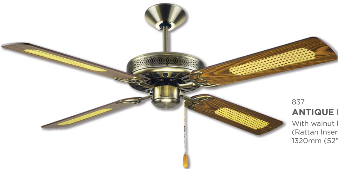
837 ANTIQUE BRASS With walnut blades (Rattan Insert on one side) 1320mm (52")

^Please refer to website terms & conditions