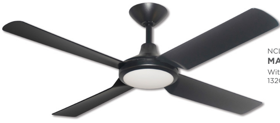
NCL2156 MATT BLACK With matt black polymer blades 1320mm (52")