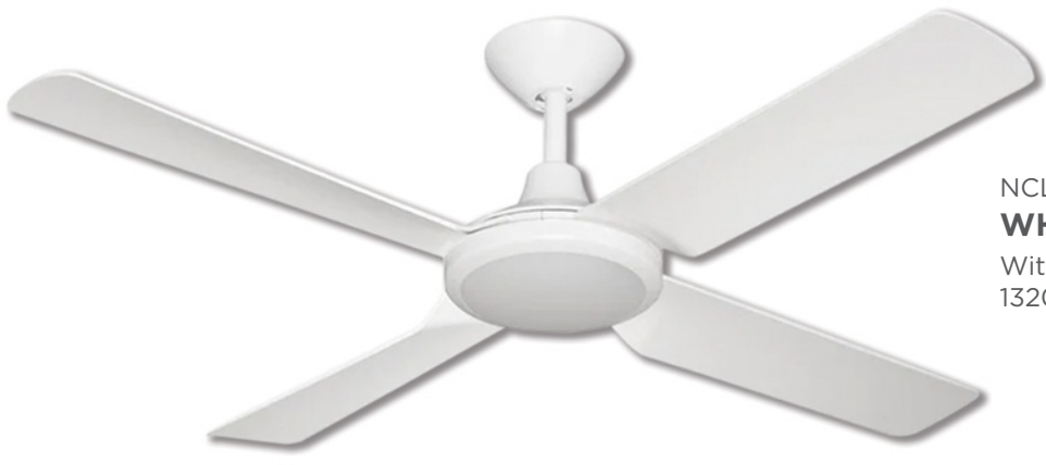
NCL2155 WHITE With white polymer blades 1320mm (52")