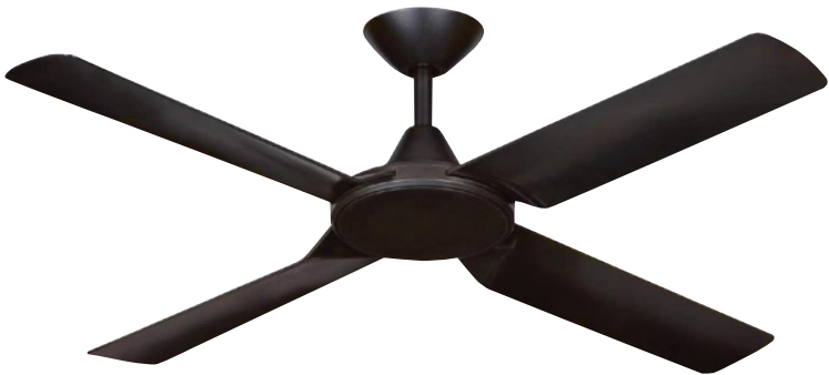
NI2102 MATT BLACK With matt black polymer blades 1320mm (52")