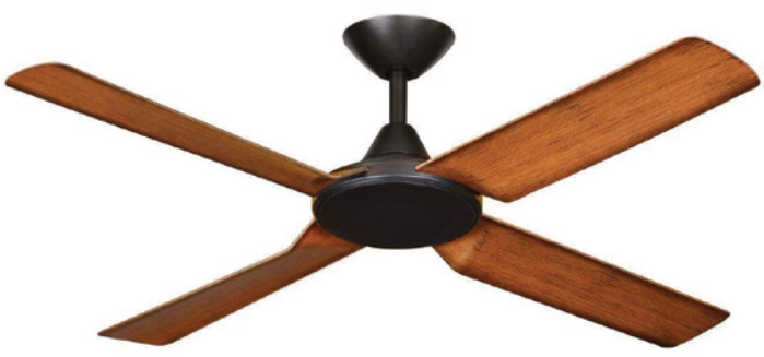
NI2103 MATT BLACK WITH KOA With Koa finished polymer blades 1320mm (52")