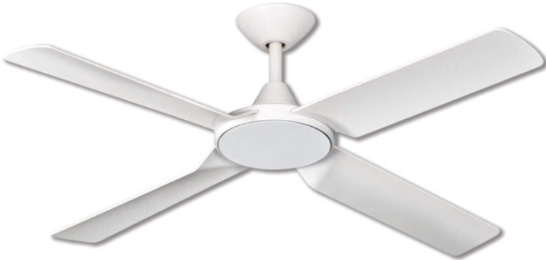
NI2101 WHITE With white polymer blades 1320mm (52")